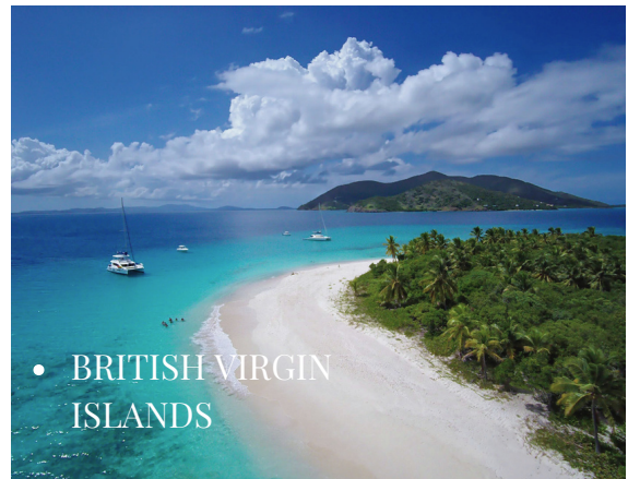
• BRITISH VIRGIN ISLANDS

Explore the world's most captivating destinations with Med Sailing Holidays and our exceptional fleet of sailing vessels. Whether you're drawn to the turquoise waters of the Adriatic in Croatia, the historical allure of the Ionian Islands in Greece, or the tropical paradise of Tahiti, our diverse fleet is tailored to transport you to your dream destination. Our meticulously selected yachts and catamarans not only promise comfort and style but also provide the perfect vantage point to soak in the beauty of each unique location. From sun-drenched coastlines to charming harbors steeped in history, our fleet is your ticket to a personalized and unforgettable sailing experience.